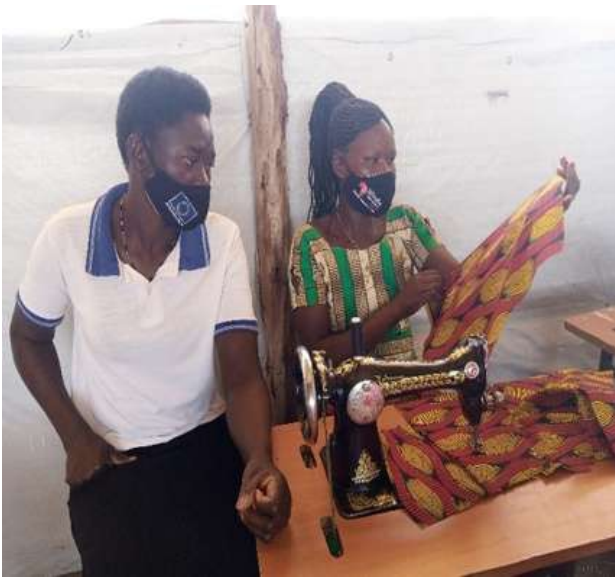
Learners for Tailoring in for practical class work at Millenium College during field visit