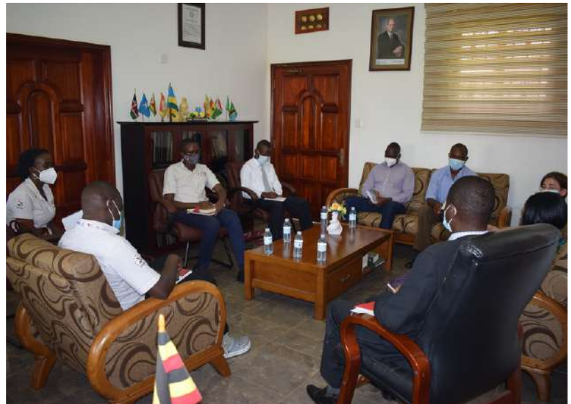
Joint Team Meeting with Bugema University Vice Chancellor

New scholars were enrolled after concluding the interview process in all refugee settlements and Kampala where 60 new students (F 27 & M 33) have been enrolled at different institutions of higher Learning within the country.