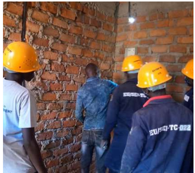
Electrical and Solar Wiring SEP Trainees during the site visit in Obongi town to test skills gained from class