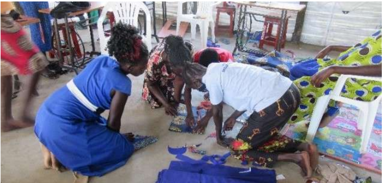
Tailoring trainees learning how to take measurements at Palorinya Primary School