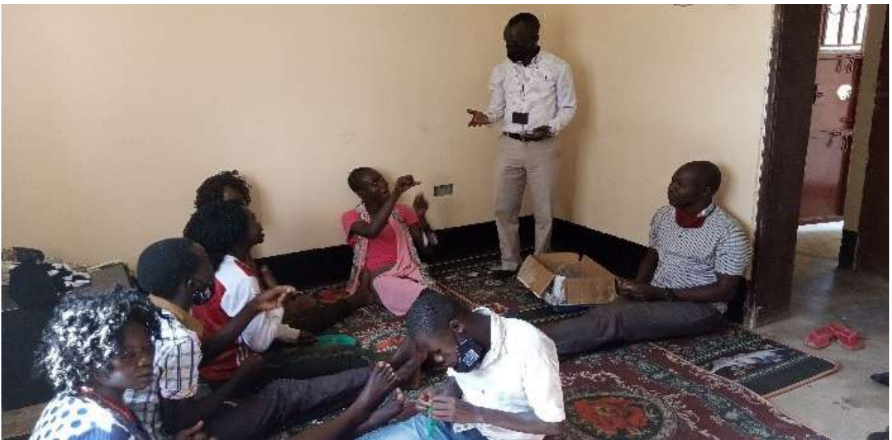
SEP Project Coordinator interacting with Deaf Learners for Craft Making at St. Paul COU during field visit